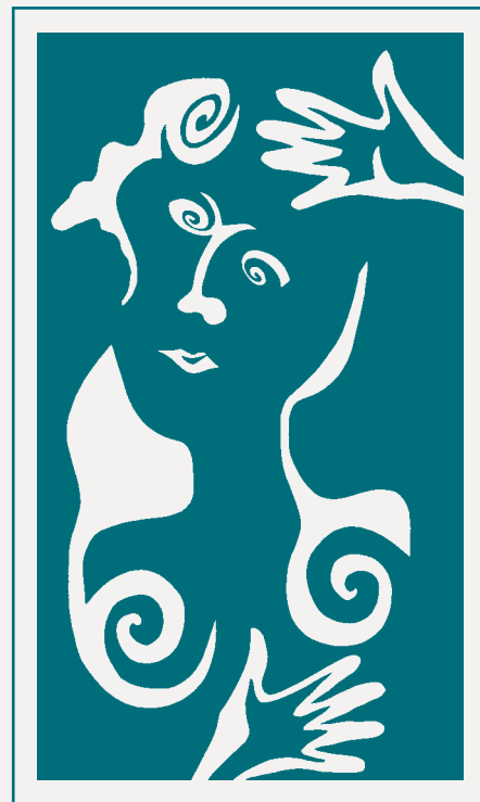
The cover design is adapted from "Evaluation", 1997, by Edwina Sandys.

Provides news items by and on women, including older women, in different countries, especially in the developing world.