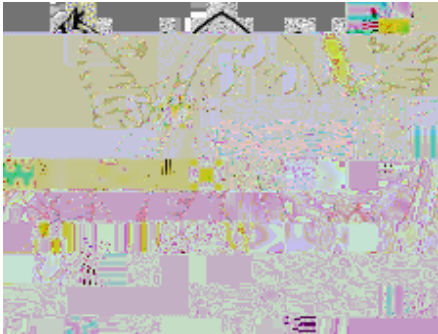
REPUBLIC OF BOTSWANA